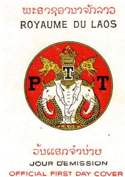
1957 Pattern "Official PTT cachet"

In 1960 a replacement pre-printed ‘official’ cachet was introduced, replacing the 1957 PTT version with a revised PTT emblem. Usages overlap, and covers with the 1957 cachet are known much later.